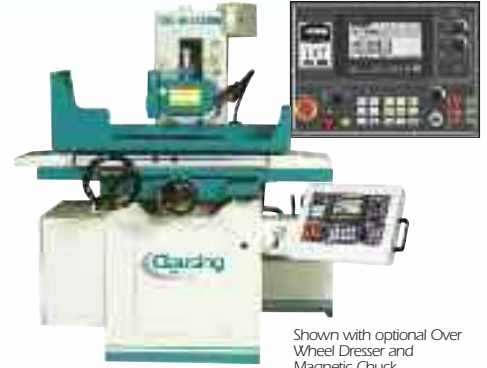
Shown with optional Over Wheel Dresser and Magnetic Chuck

ASDIII Precision Automatic Surface Grinders with Touch Control Panel and Digital Display.