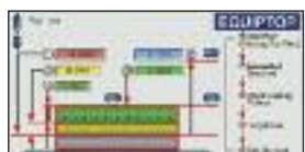
Grinding Size Input