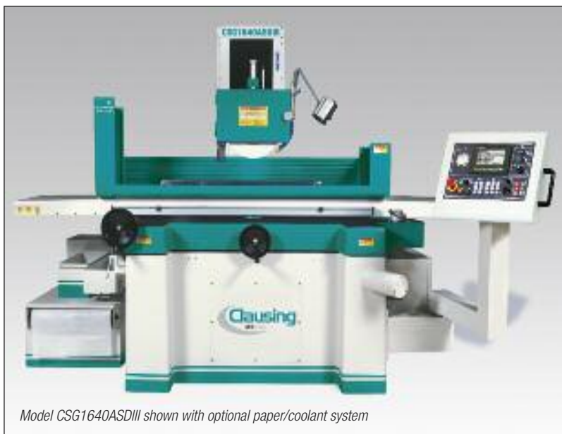
Model CSG1640ASDIII shown with optional paper/coolant system