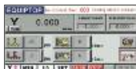
Grinder Condition Input